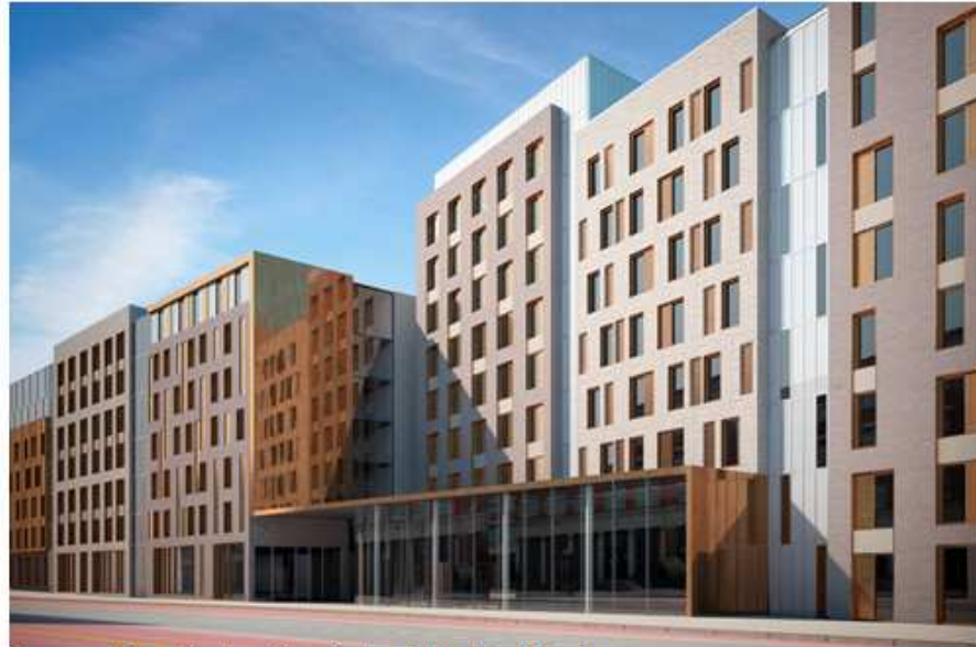
Approved north elevation facing Mile End Road