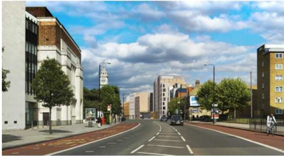
View of Approved development looking east along Mile End Road