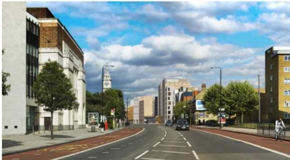
View of Proposed development looking east along Mile End Road

9.60. The currently proposed building would be broken down into eight main volumes which would read as individual but related elements. The Committee previously accepted that such a design approach overcame Refusal Reason 2 of the decision of 14 th October 2009 (Paragraph 5.3 above) concerning inadequate modulation of the façade.