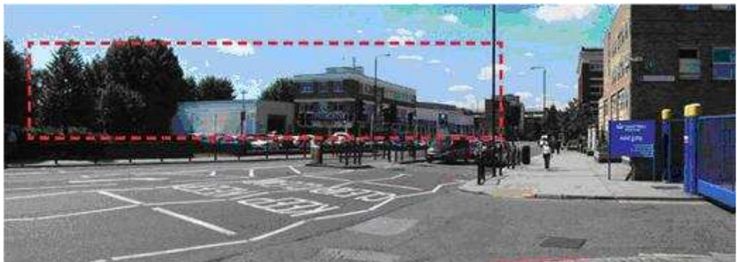
Former buildings now demolished. Application site marked by broken line

4.14. In total, there was previously approximately 2,700 sq. m of accommodation across the site split between the car showroom use (2,429 sq. m) and the bar/nightclub (240 sq. m).