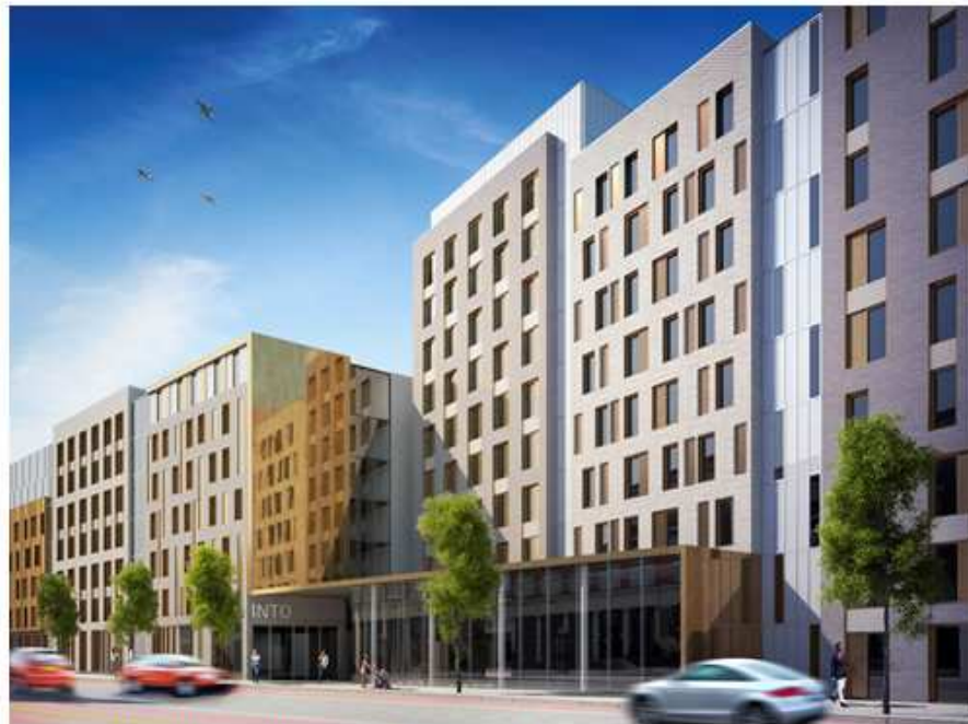
Proposed north elevation facing Mile End Road